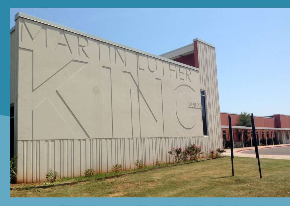
Oklahoma City Public Schools